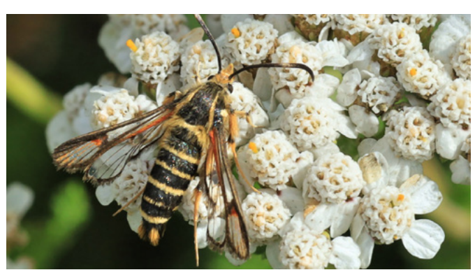
New rare species of insects have already been found in Kong Hans Have, which biologists have not previously seen in Gladsaxe.